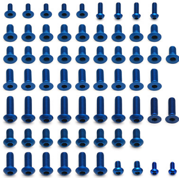
#8557, 65 screws

Available for Team Associated 12R5/12R5.1, 10R5, and 10R5 Oval, these complete sets of 65, 66, and 78 screws replace the heavy stock steel screws and can be fitted to any vehicle that uses metric hardware.