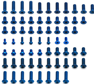
#8558, 66 screws