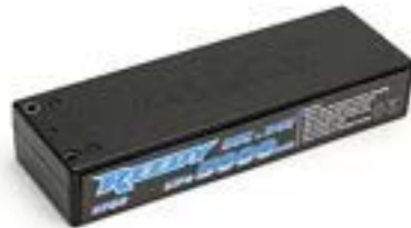
#709 Reedy LiPo 5000mAh 7.4V 35C battery

Associated recommends the following battery for maximum performance: